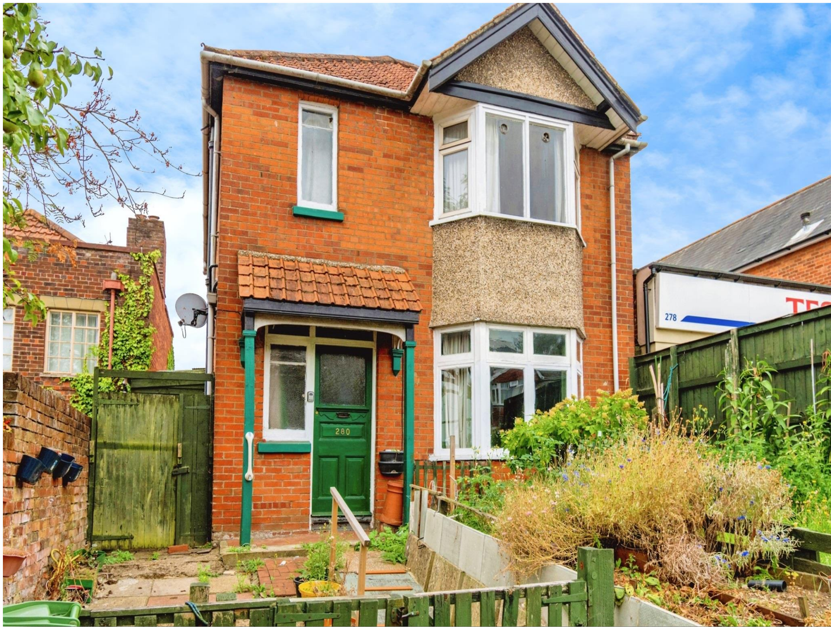
Burgess Road, Southampton SO16 3BE