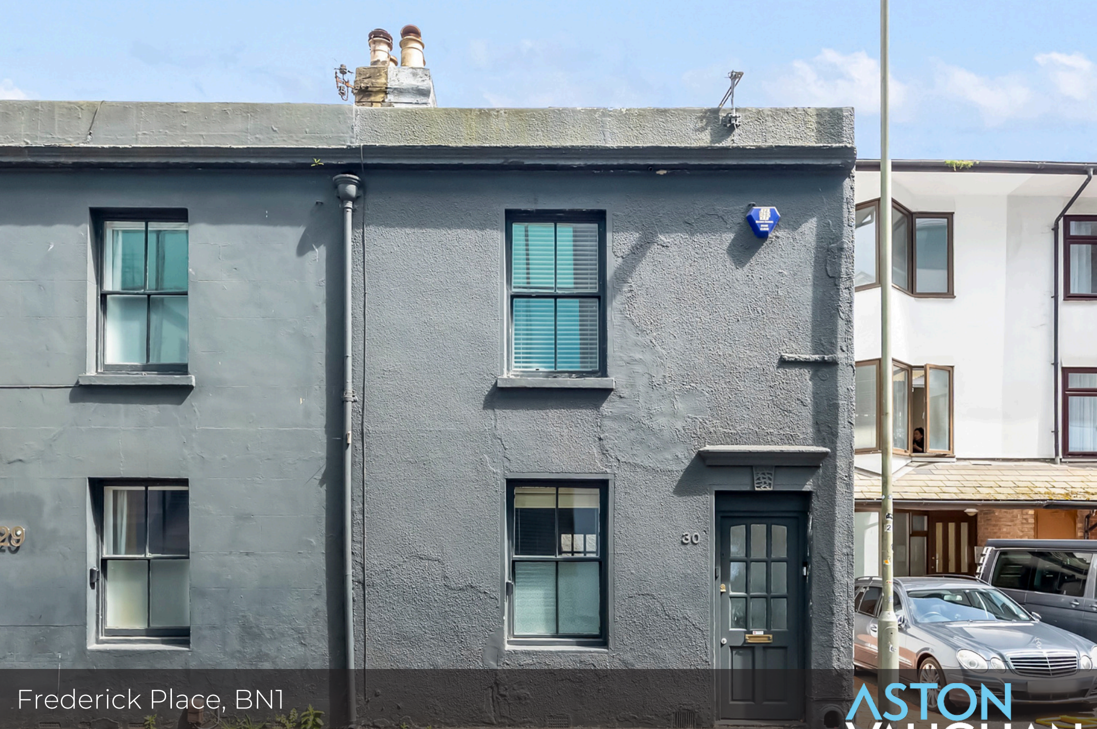
Frederick Place, BN1 Guide Price £425,000 - £450,000