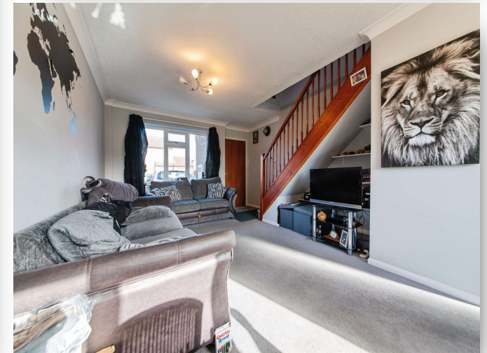
Alder Road, Sleaford NG34 7GW