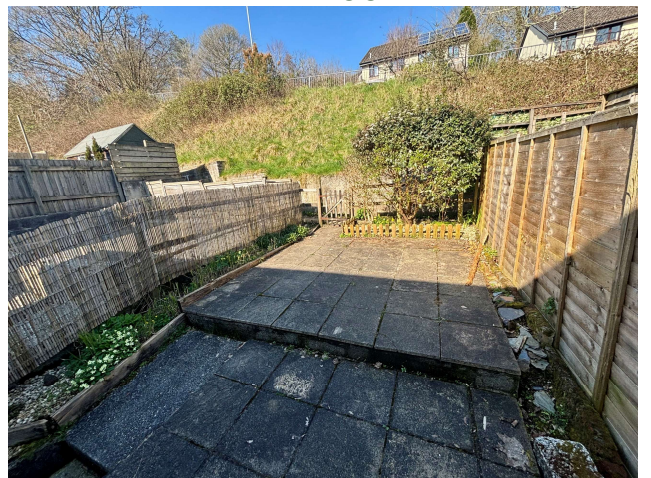
REAR PATIO GARDEN