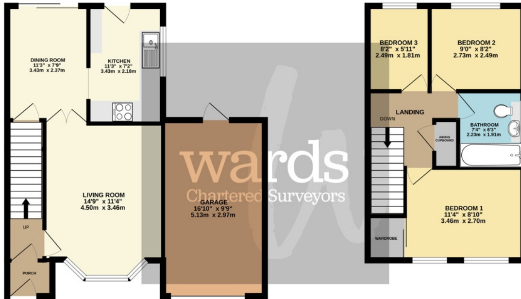
TOTAL FLOOR AREA : 914 sq.ft. (85.0 sq.m.) approx.

Whilst every attempt has been made to ensure the accuracy of the floorplan contained here, measurements of doors, windows, rooms and any other items are approximate and no responsibility is taken for any error, omission or mis-statement. This plan is for illustrative purposes only and should be used as such by any prospective purchaser. The services, systems and appliances shown have not been tested and no guarantee as to their operability or efficiency can be given. Made with Metrapix ©2026