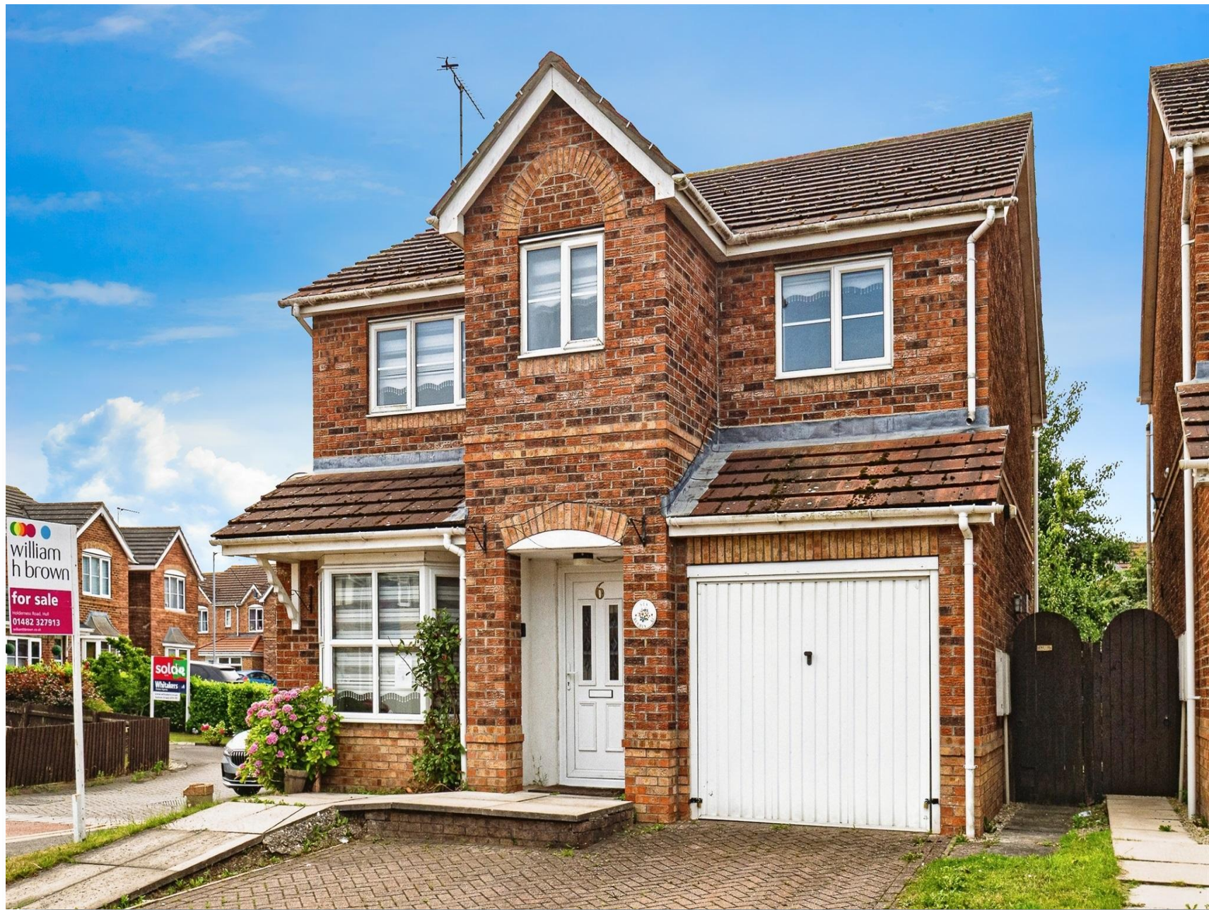
Bushey Park, Kingswood, Hull, HU7 3JF