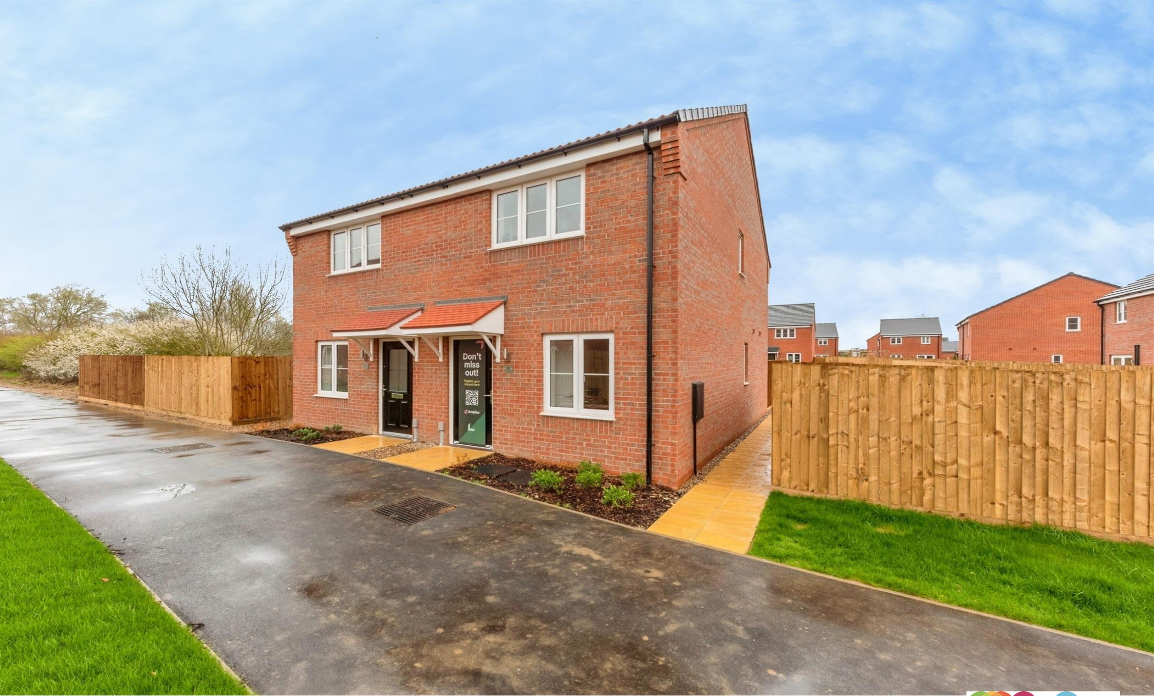
The Oak - Manthorpe Chase Manthorpe Chase, Manthorpe Grantham NG31 8FH