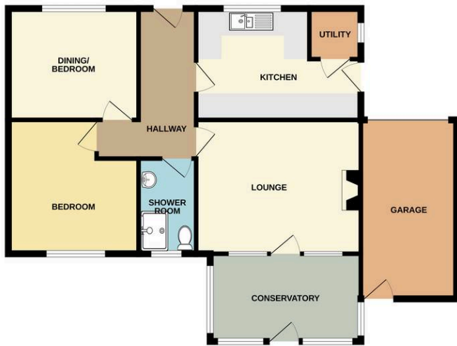
GROUND FLOOR 854 sq.ft. (79.3 sq.m.) approx.