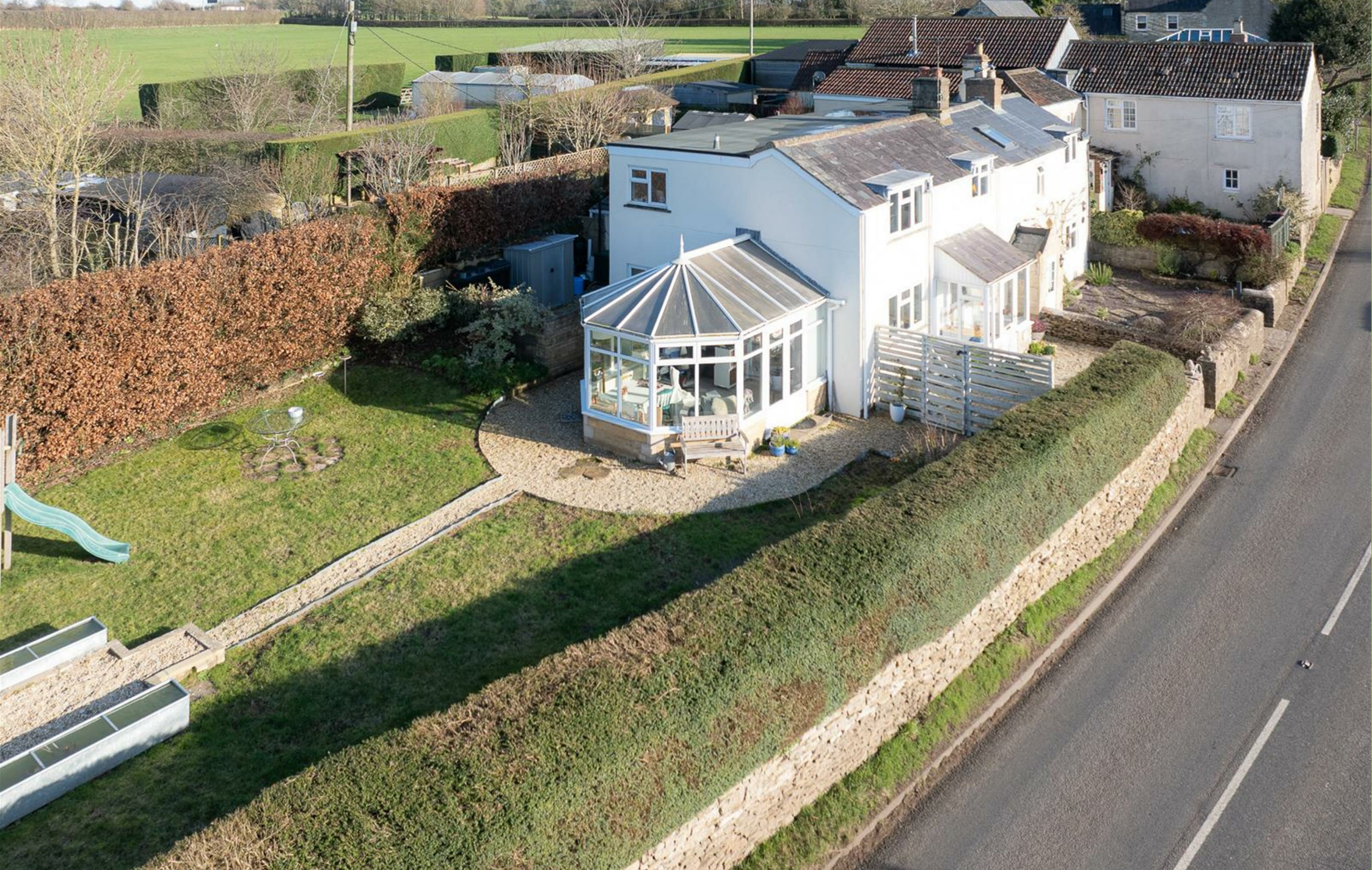
The Gibb Littleton Drew