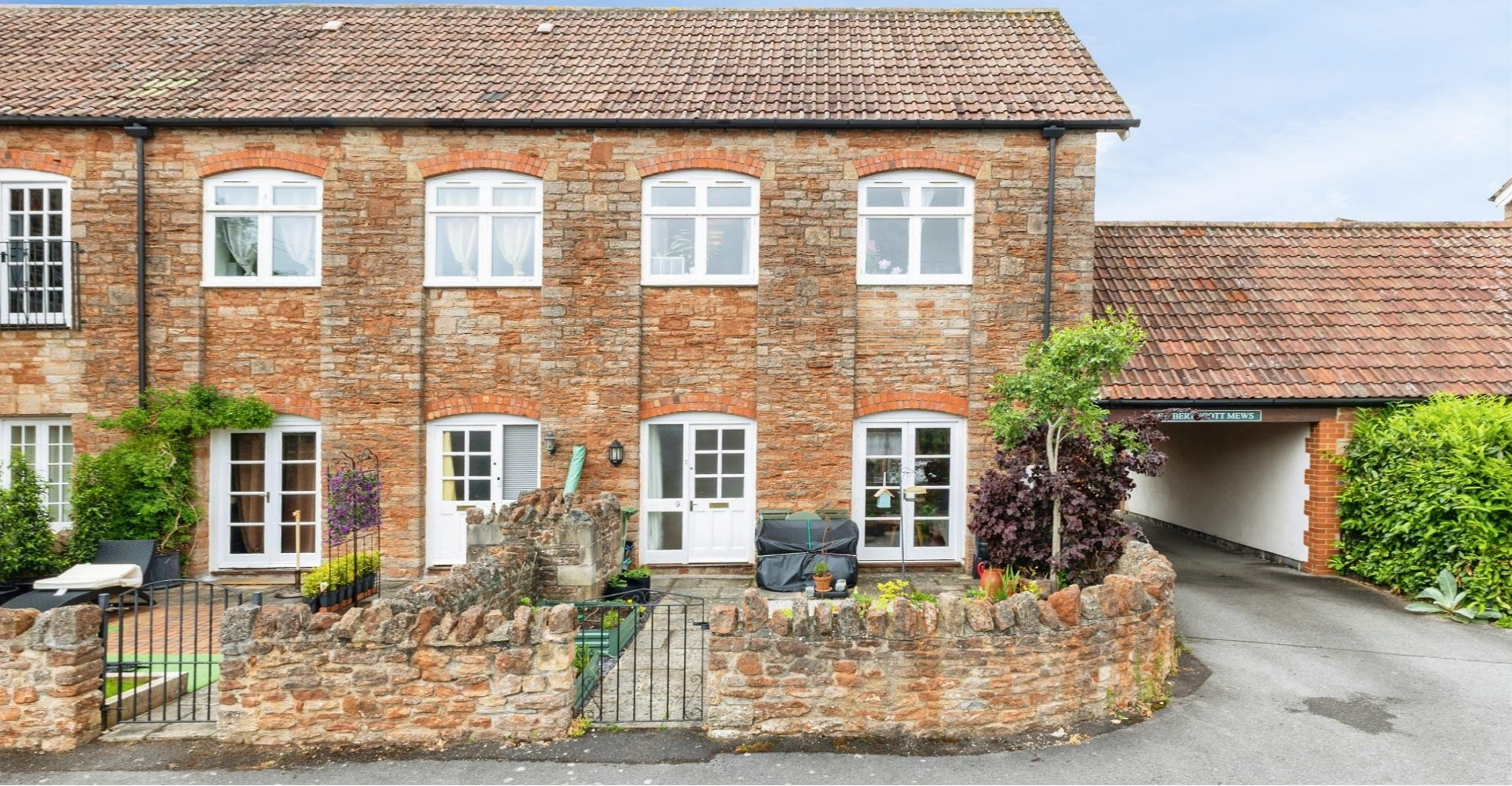
Gilbert Scott Mews, South Horrington Village, Wells, BA5 3LH