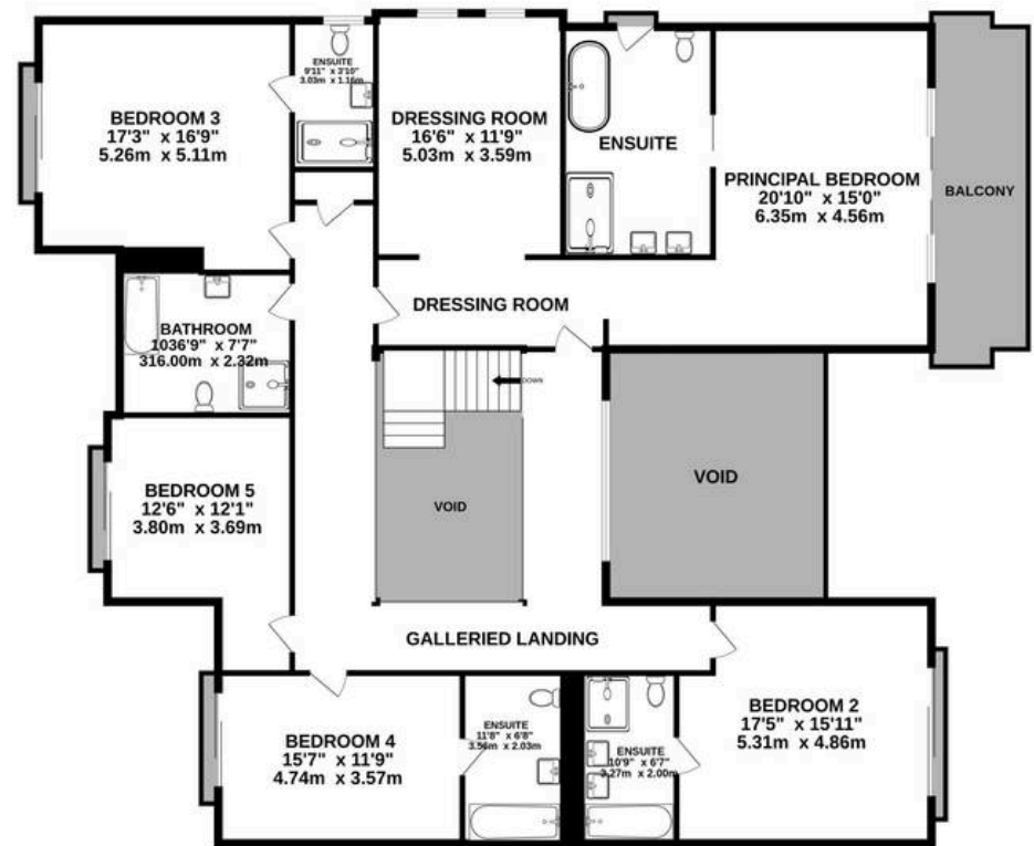
TOTAL FLOOR AREA : 5285 sq.ft. (491.0 sq.m.) approx.

Whilst every attempt has been made to ensure the accuracy of the floorplan contained here, measurements of doors, windows, rooms and any other items are approximate and no responsibility is taken for any error, omission or mis-statement. This plan is for illustrative purposes only and should be used as such by any prospective purchaser. The services, systems and appliances shown have not been tested and no guarantee as to their operability or efficiency can be given.