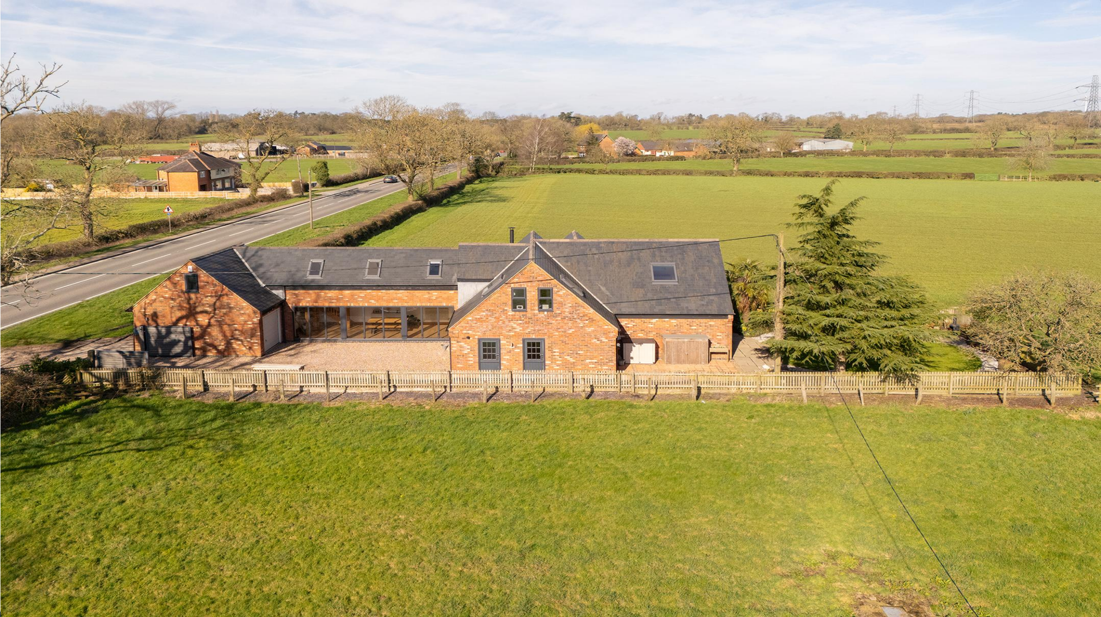
Meadow Cottage, Leicester Road, Lutterworth, LE17 4LX