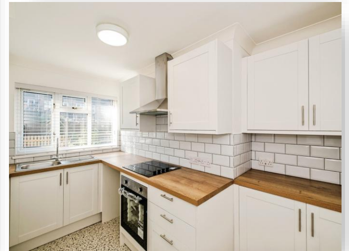
Orchard House Crabtree Lane,Lancing BN15 9PE