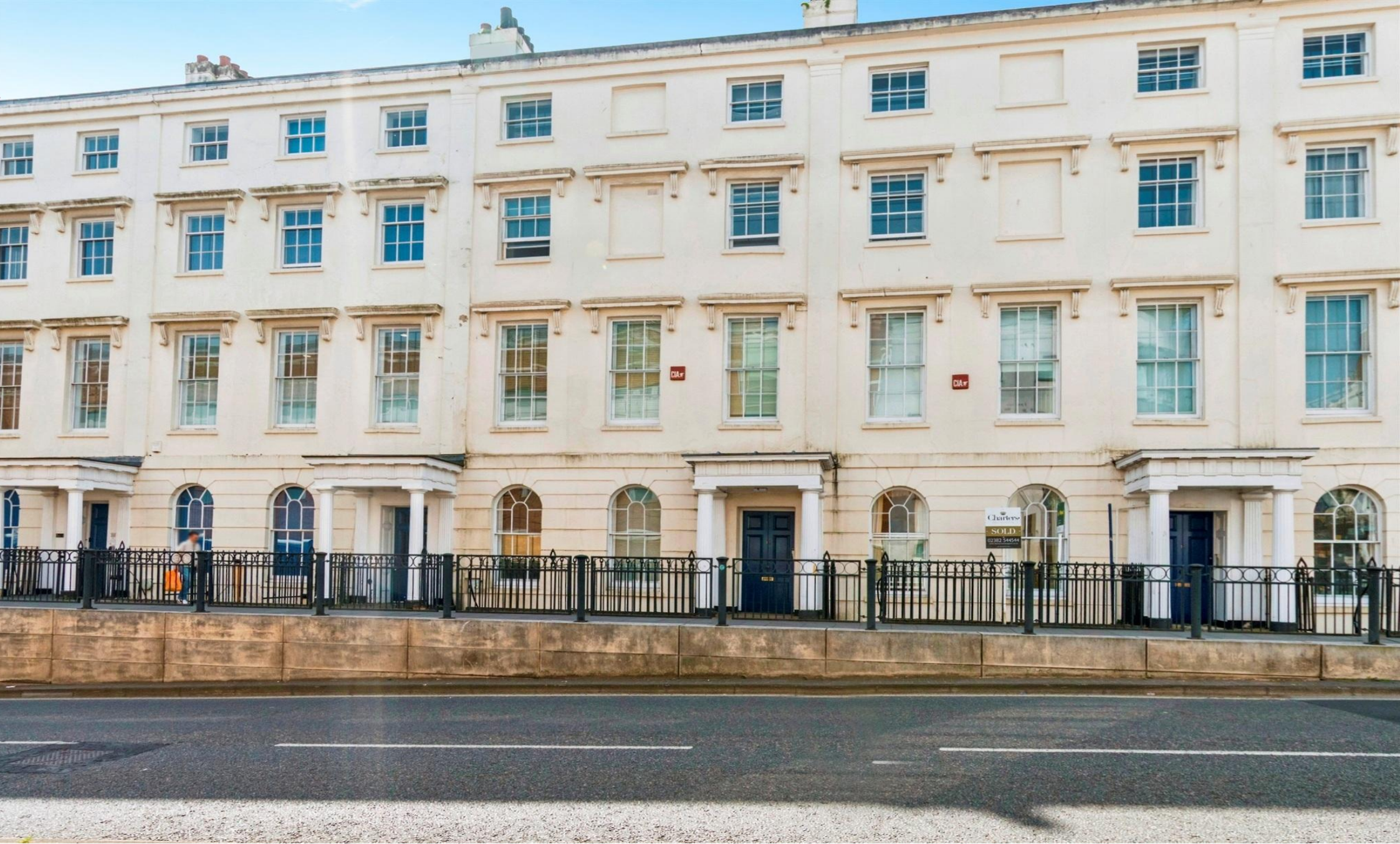
Portland Terrace, Southampton SO14 7EA