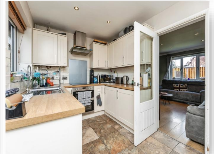
Kingsmill Close, Morley Leeds LS27 9RZ