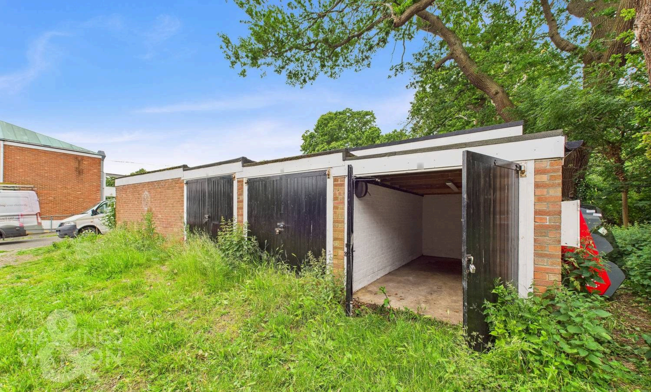
Garage 25, Speedway Recreation Road, Norwich - NR2 3PP