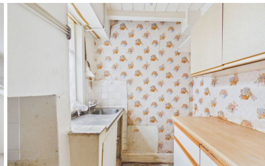
2 MOORLAND TERRACE, FYLINGTHORPE- 2 bed Cottage -£225,000