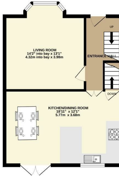
GROUND FLOOR 467 sq.ft. (43.4 sq.m.) approx.