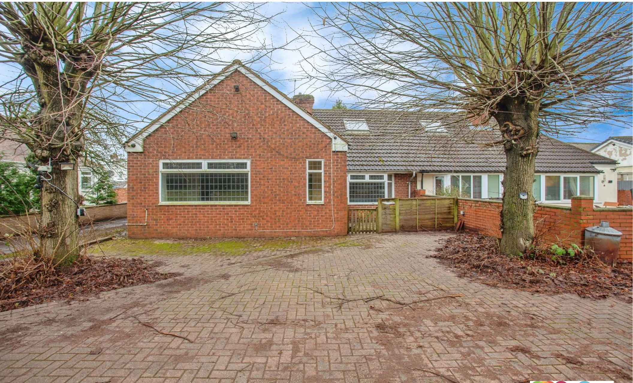
The Bungalows, Barlborough Road Chesterfield S43 4QZ