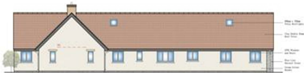
PROPOSED SOUTH (REAR) ELEVATION 1:100