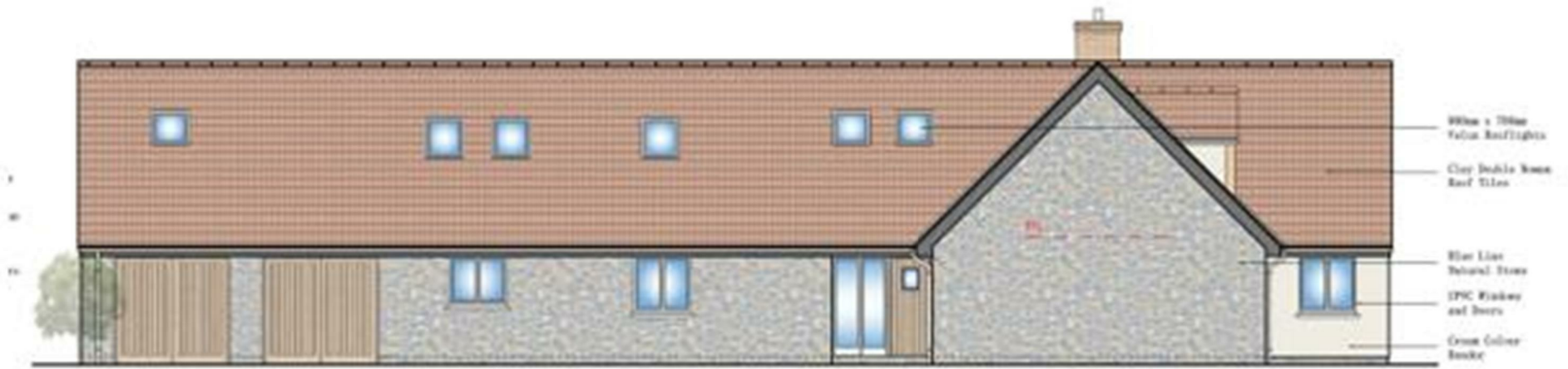
PROPOSED NORTH (FRONT) ELEVATION 1:100