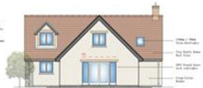
PROPOSED WEST (SIDE) ELEVATION 1:100