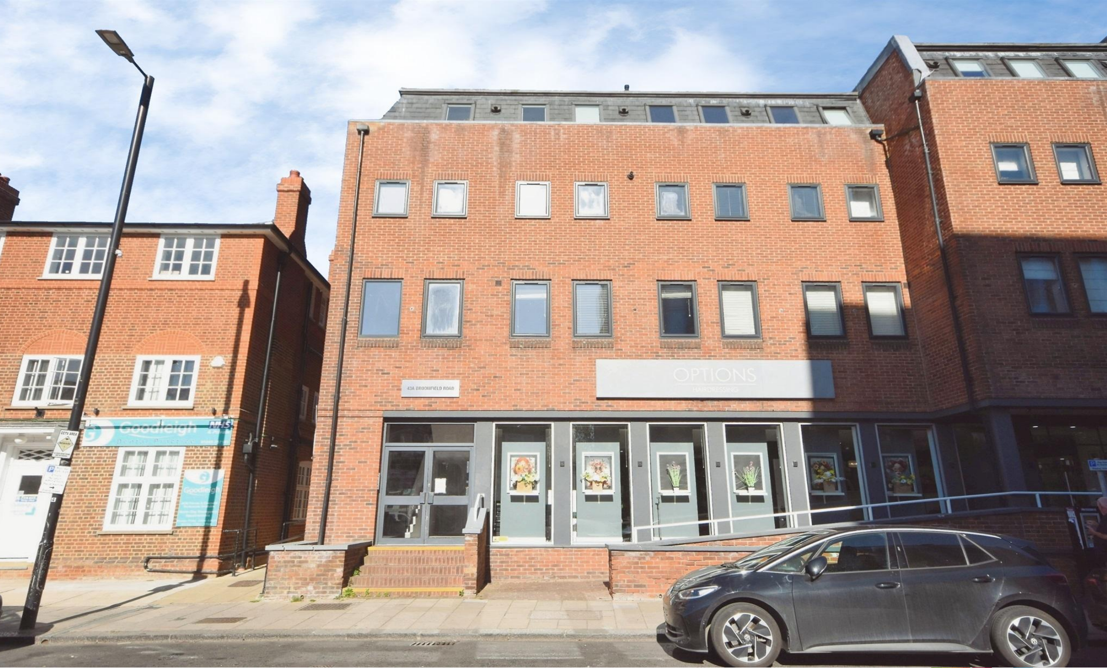
Broomfield Road, Chelmsford CM1 1SY