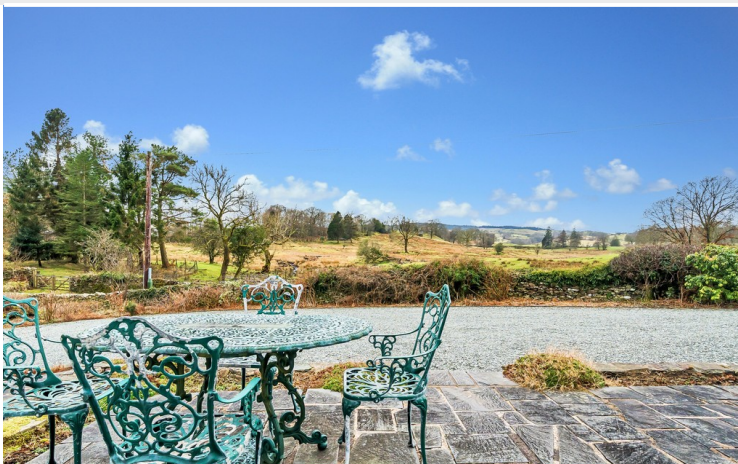
Patio Seating Area

Entering in to the main entrance hall which is a useful and open space ideal for muddy boots and wet outdoor clothes before leading you in to a bright and airy breakfast kitchen. Here, you will be stopped in your tracks by the incredible view from the bay window, which allows plenty of natural light in. Providing everything one would need for modern day living with a range of stylish wall and base units, laminate worktops, stainless steel sink and drainer, gas hob with extractor over, eye level oven, integrated dishwasher, fridge freezer and washer dryer – this well equipped kitchen is the perfect space to enjoy a meal with family and friends.