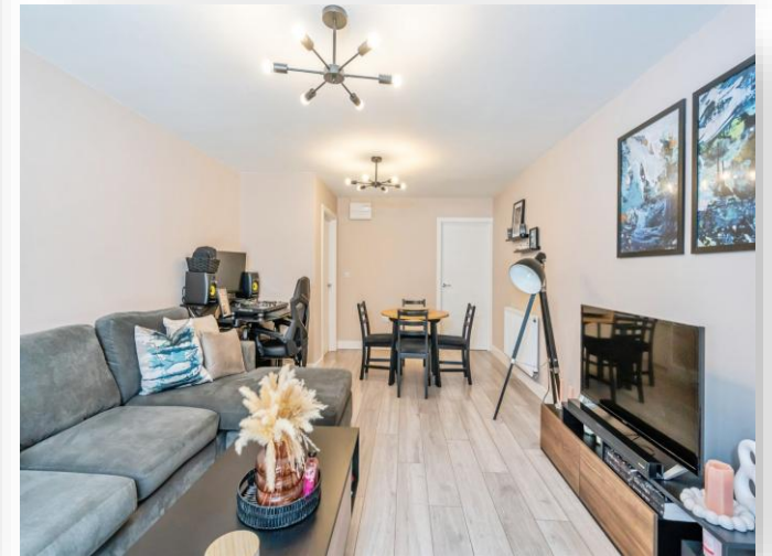
Abbeyfield Richmond Avenue, Richmond Avenue Bognor Regis PO21 2GE