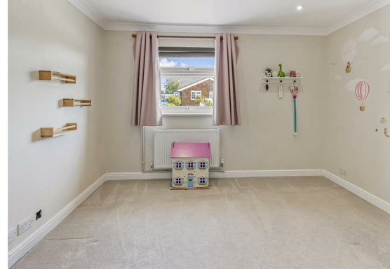
Bedroom two 11'5 x 10'4 (3.48m x 3.15m)