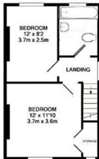
1ST FLOOR APPROX. FLOOR AREA 356 SQ.FT. (32.5 SQ.M.) TOTAL APPROX. FLOOR AREA 864 SQ.FT. (80.3 SQ.M.)