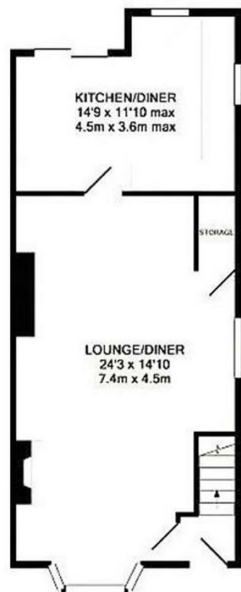
GROUND FLOOR APPROX. FLOOR AREA 514 SQ.FT. (47.8 SQ.M.)