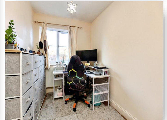
Lillycourt House Lower Street, Kettering NN16 8DL