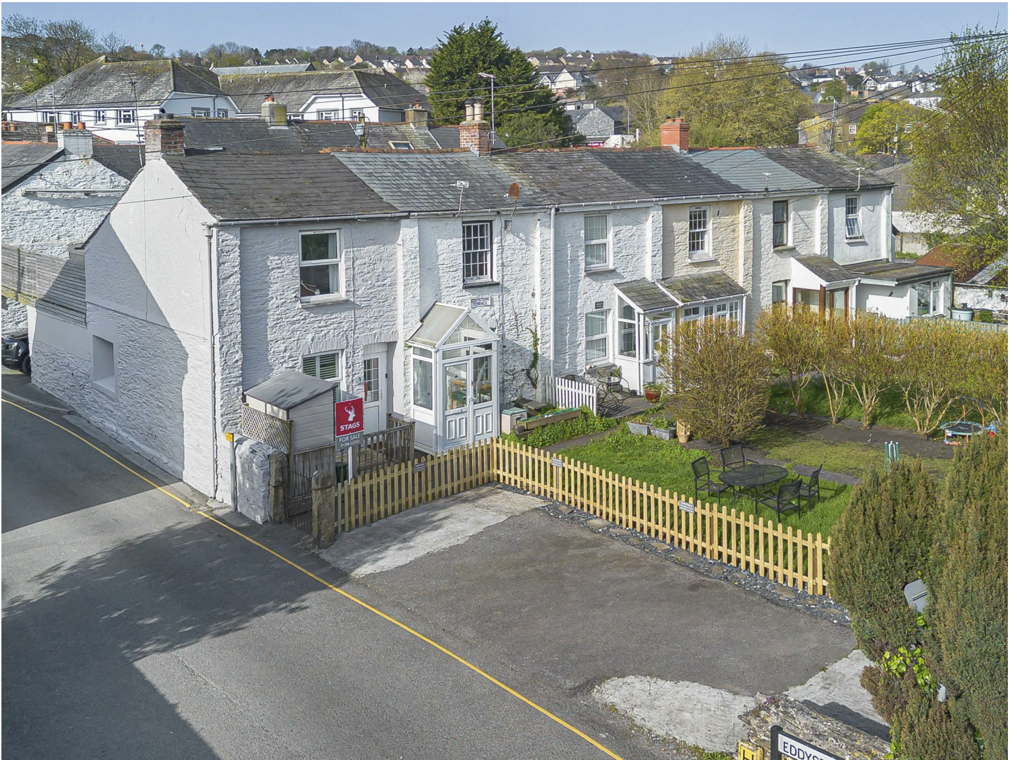
1 Eddystone Terrace