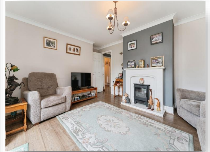
Brandon Road, Methwold, Thetford, IP26 4RH