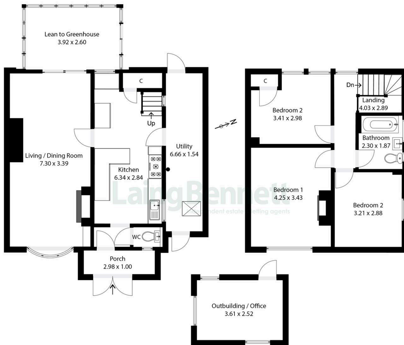
Illustration for Identification purposes only. Measurements are approximate. Dimensions given are between the widest points.

Approximate Gross Internal Area (Excluding Greenhouse and Office) = 110 sq m / 1184 sq ft Office = 9 sq m / 97 sq ft