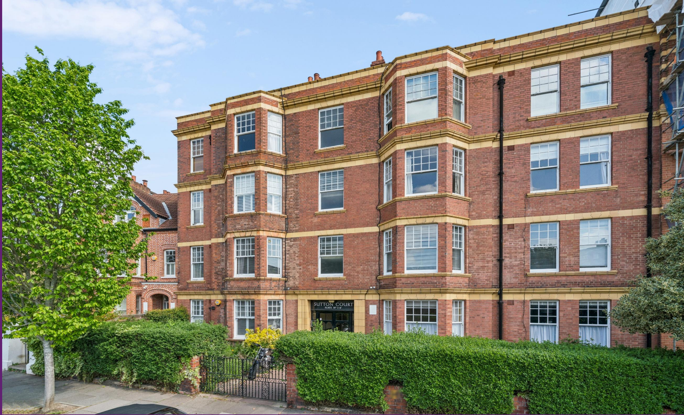
Sutton Court Fauconberg Road, W4