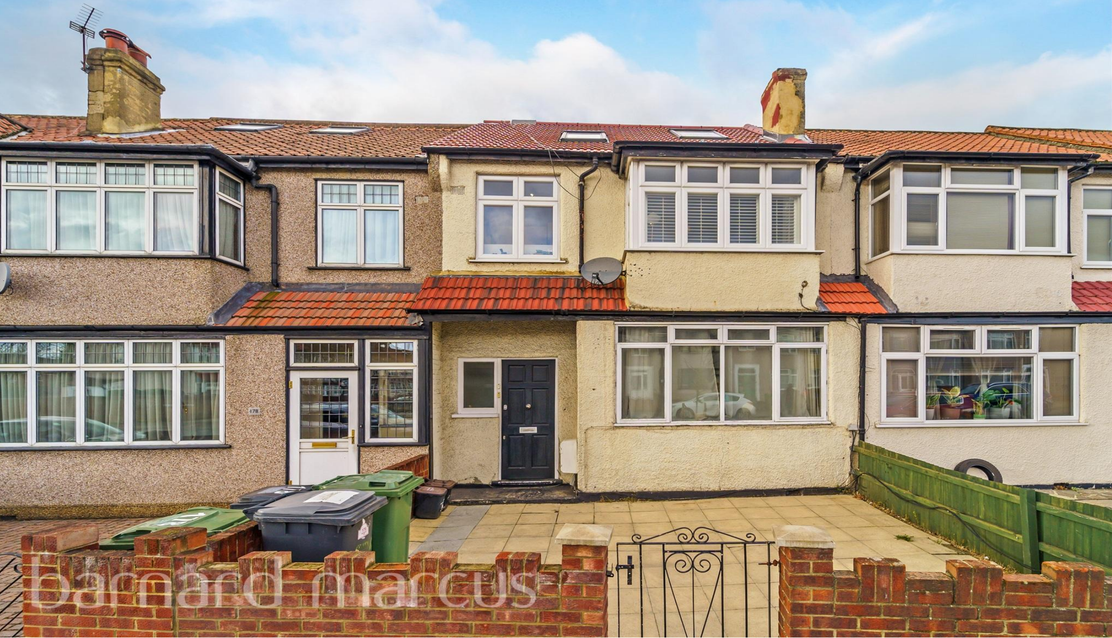
Streatham Vale, London SW16 5TB