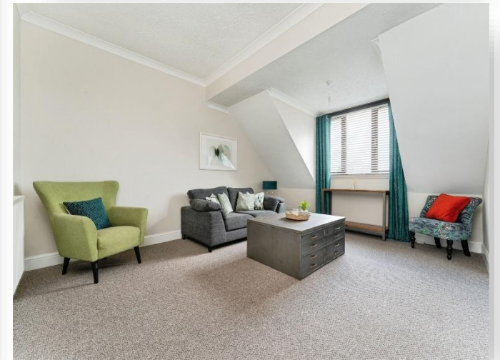
Leamon Court, Brandon, IP27 0RR