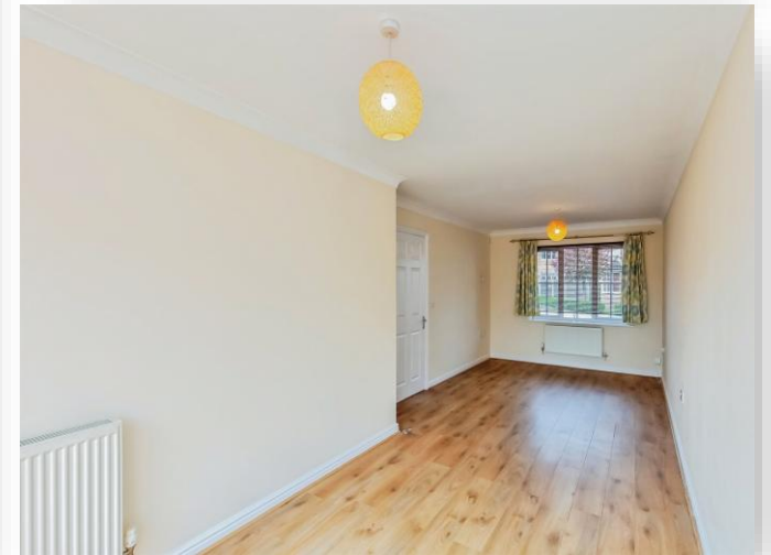
Aston Close, Yaxley Peterborough PE7 3BF