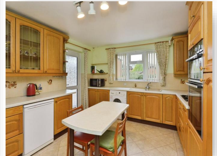
Badgemore Court, Two Mile Ash Milton Keynes MK8 8AF