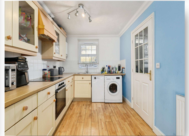
Beaufort Close, Norwich NR6 6GA