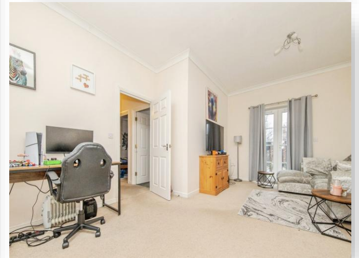
Breydon Way, Ipswich, IP3 9GA