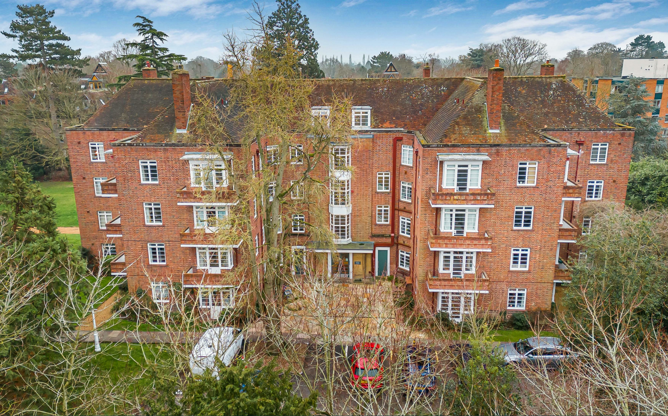
Manor Court, Pinehurst, Cambridge, CB3 9BE