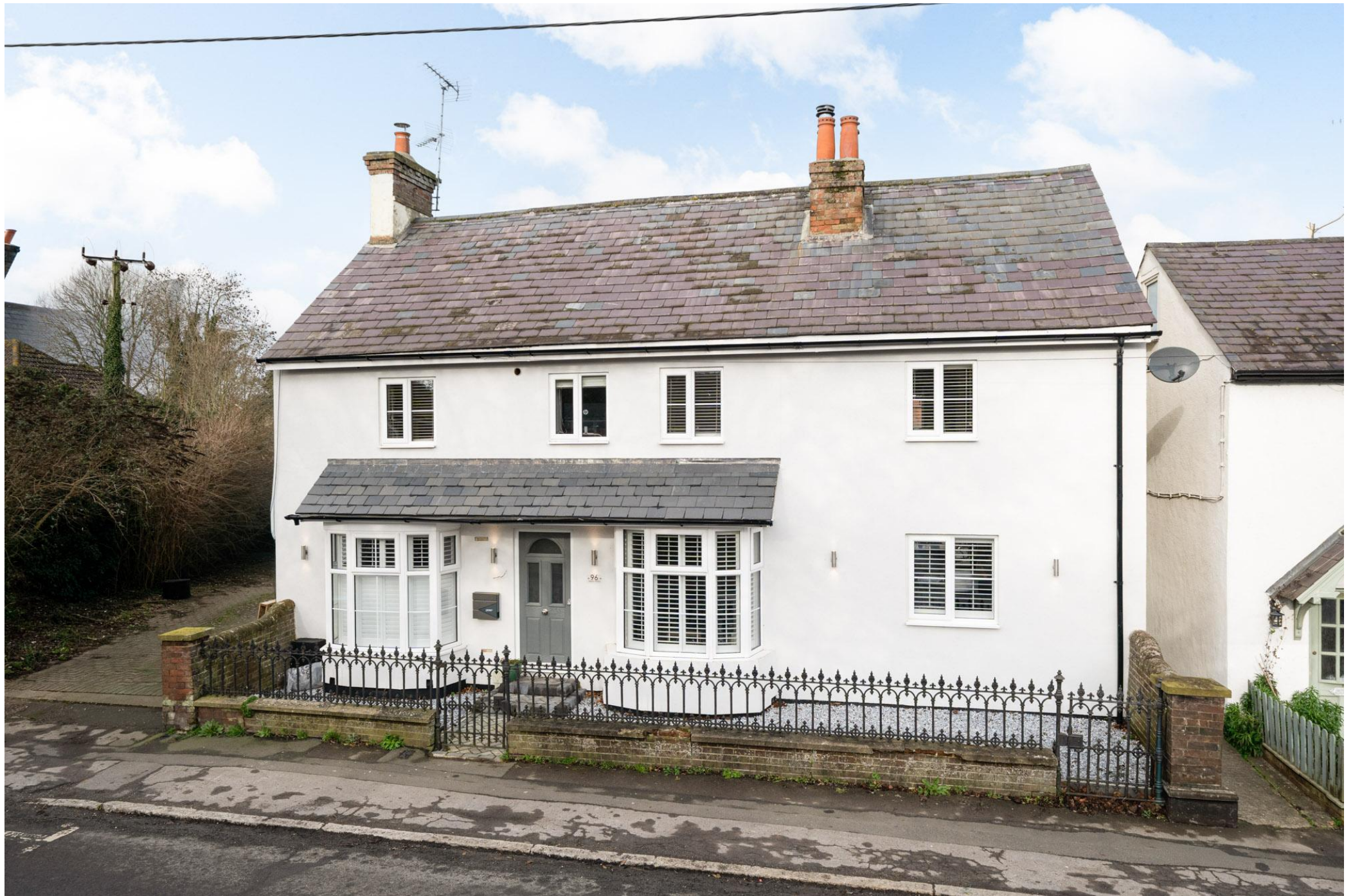
Weston Road, Aston Clinton, HP22 5EJ