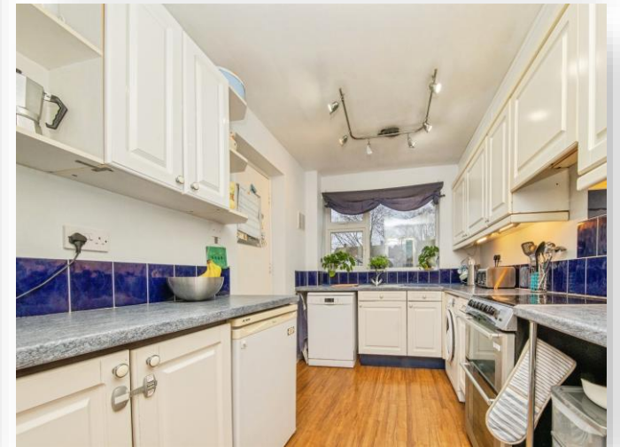
Monton Rise, Ipswich, IP2 9QQ