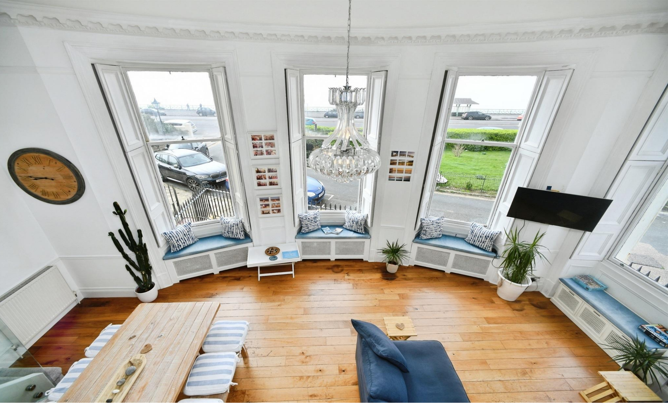
Collingwood House, Marine Parade, Brighton, BN2 1DE