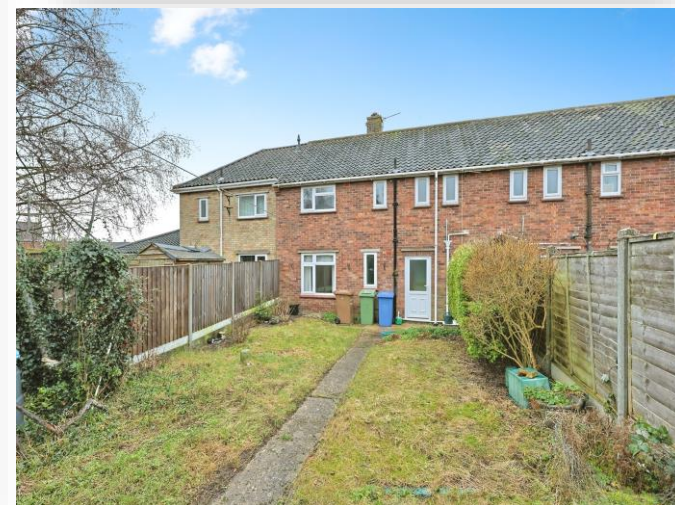
Barnesdale Road, Norwich, NR4 6LL