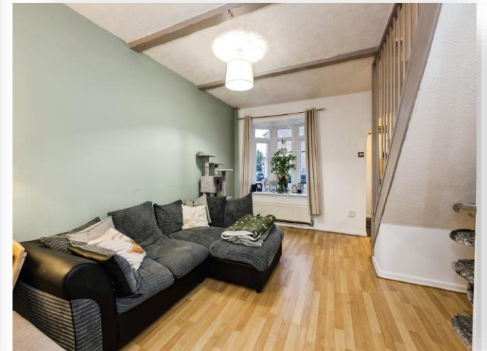
Elm Close, Yaxley PETERBOROUGH PE7 3YW