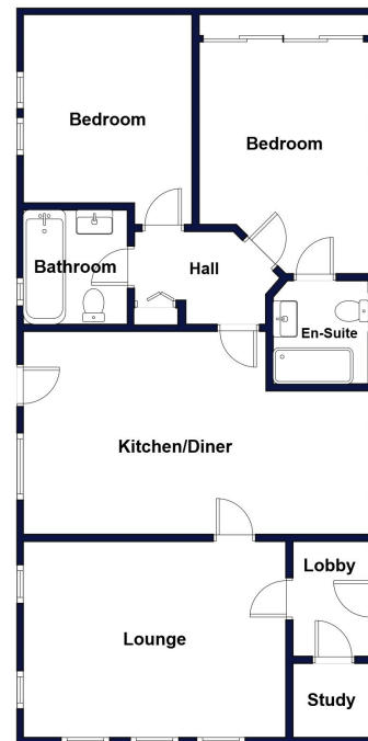
This drawing has been prepared for diagrammatic purpose only. Not to scale.