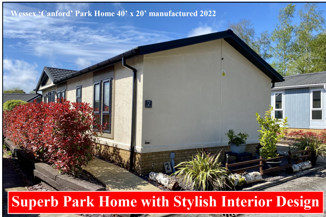
Wessex 'Canford' Park Home 40' x 20' manufactured 2022

2 Willows Way, Regency Heights, Blandford Road North, Poole. BH16 6GG