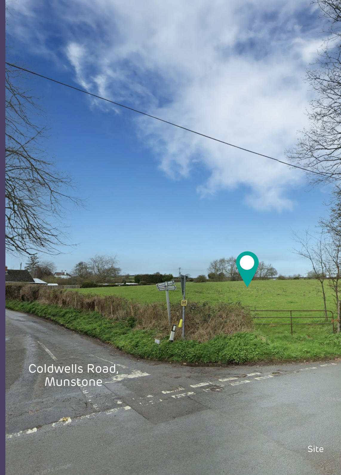
Coldwells Road, Munstone

Its position at a crossroads provides strong visibility and a natural point of access, while the surrounding context of existing housing supports the principle of residential use, subject to necessary planning consents.