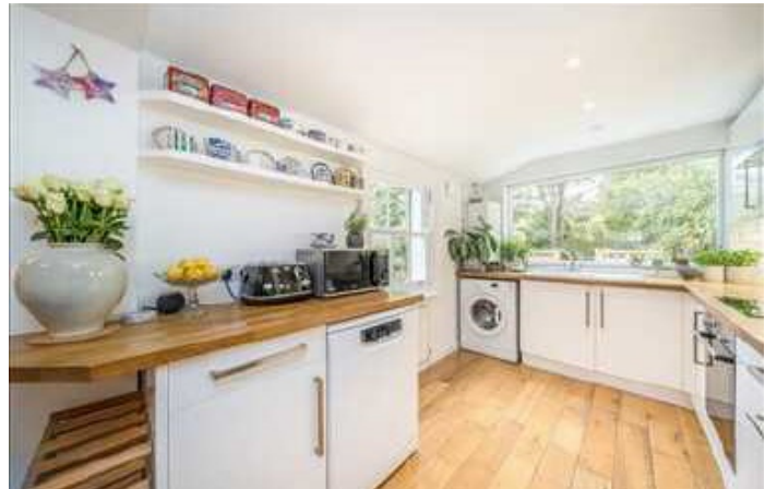
Brightfield Road, SE12