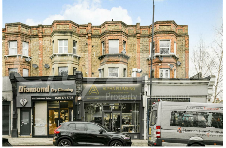
WEST HILL SW18