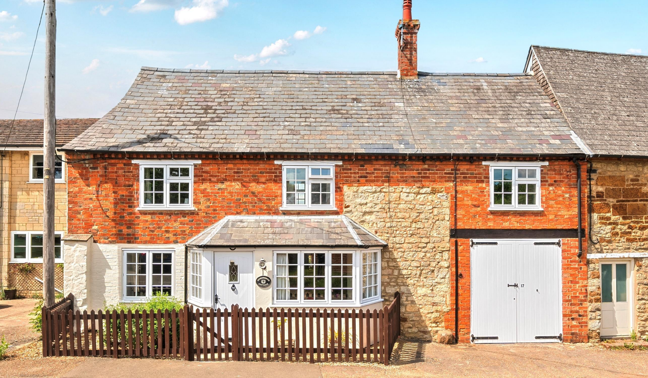
Horseshoe Cottage, 17 Greenside, Wappenham, Northamptonshire, NN12 8SH