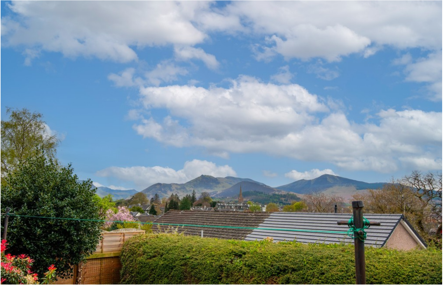
View From Rear Garden