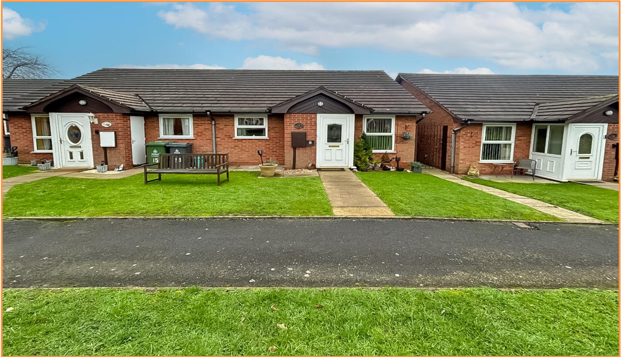
Cotswold Grove, Willenhall, WV12 5YZ