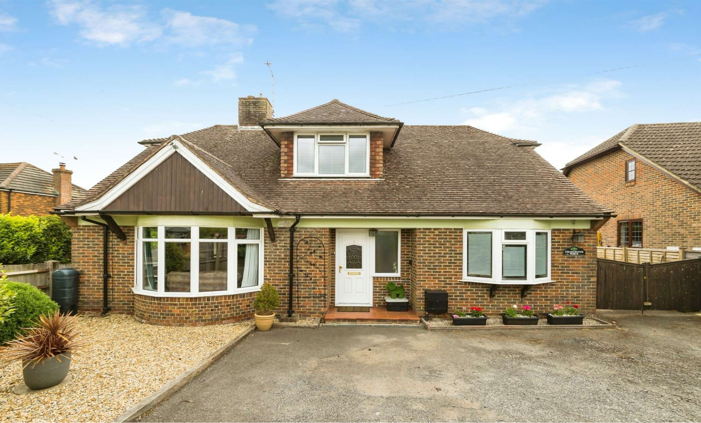
Charlecote Place, Church Road, Scaynes Hill, Haywards Heath RH17 7NY